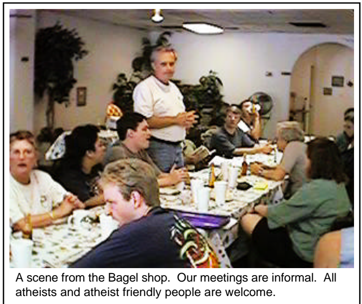
A scene from the Bagel shop. Our meetings are informal. All atheists and atheist friendly people are welcome.