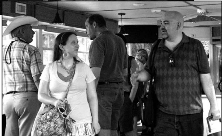
Left: Snacking and conversation on the bottom deck.