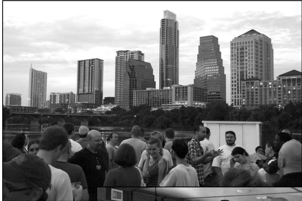
Above: Viewing the Congress Avenue Bridge from the top deck of the boat at sunset.